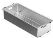
AQBCO COLANDER 445 X 165mm